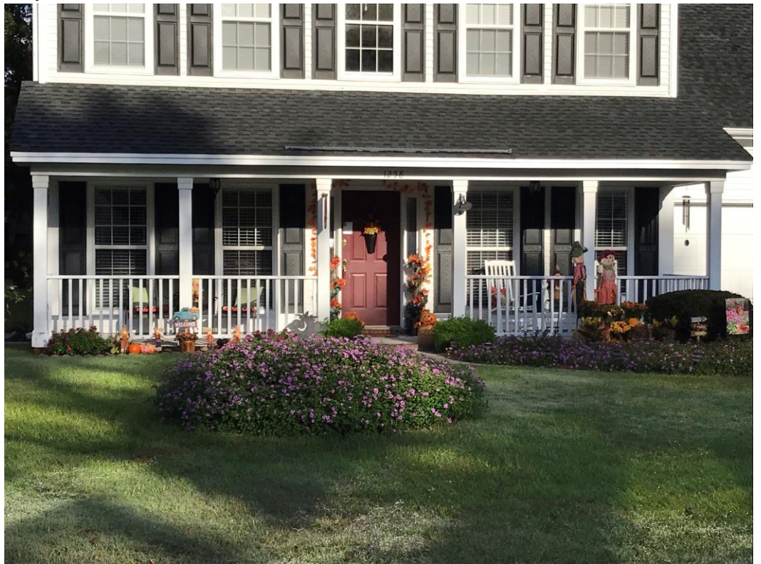
Ghosts and Goblins: 1295 Horseshoe Bend